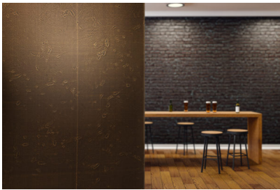
Caption 2: "Moon" features copper or brass as here under a surface that appears to have the kinds of flaws left behind by a plasterer working with stone chippings under his trowel.