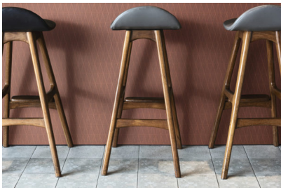
Caption 3: In the interplay with the "Diamond Antique" surface, copper experience a contrast between gentle colour gradients and a clear linearity. Under the diagonal and regular rhomboid structure, the skilfully finished metal is perfect for a playful combination of light, form and colour in the ambience of exclusive applications.