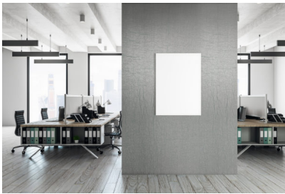
Caption 1: On the surface, the micro cracks characteristic of "New Crisp" follow paths of their own way. Depending on how it is worked, colouring varies. With "New Crisp Oxygreen", the fine veining is more prominent.

Gold, natural silver, smoke grey or copper red, in mirror-gloss finish with „Cella“, „Cascade“ or „Crossline“ structure – the new decors from the „Glossy Line“ once again underscore Homapal's expertise in producing surfaces coated in real metal. High-gloss decors in five different colour ways and three surface textures exude a touch of luxury. With a tactile feel all of their own, the panels produce an exceptional look with a diverse range of colours and striking gloss finish – a perfect combination for distinctive designs.