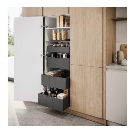
Caption 1: 70 years after the market launch of the first kitchen scoop, Ninka has relaunched the product. 'Konda' is recommended as a practical accessory for shelves and pull-outs, not only for space-saving and long-lasting storage, but also for tidy storage.

There's also something new in the drawer! The organisational star "cuisio" is now also available in 400 mm, 450 mm, 550 mm and 600 mm depths in addition to the standard 500 mm. Thanks to six new moulds, Ninka can injection mould all depths in one piece. As a result, the entire range now comes with a constant wall thickness in a full-surface, seamless and therefore easy-to-clean design that adapts to the narrow frame look of modern drawers with a clear edge. With this innovation, "cuisio" remains compact and elegant at the same time. The combination of translucent plastic shells in black, white or graphite and aluminium connecting profiles in stainless steel look, aluminium, black or gold offers flexibility. The connecting rails in champagne are new.