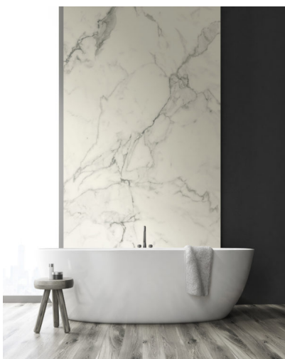
Caption 1: Now including a new system for styling bathrooms, spa facilities and wellness centres, Homapal is expanding its range of expertise in creating interiors with a focus on discerning design.

The „Aquaris Spa System“ is complemented by a set comprising shower element in matching board finish, adhesive as well as profiles in stainless-steel look. The system is quickly fitted while producing hardly any dirt – a key economic aspect; this means that rooms are soon ready for use again when refurbishing residential buildings, hotels, old people's homes and public facilities. Covering a large area, involving hardly any joints and hygienic, the „Aquaris Spa System“ also comes with a low-maintenance surface.