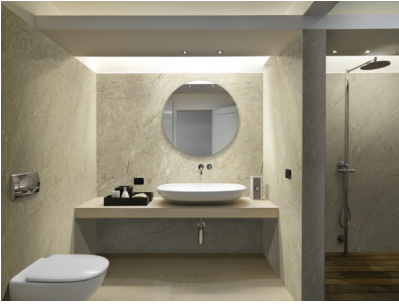
Caption 2: Tongue and grooved on the long side, the "Aquaris Spa System" is simply glued to almost any existing substrate surface in situ without significant drying and waiting times. This also makes the new system a cost-effective alternative to tiling.