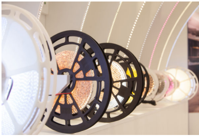
Caption 1: "D-Flexi 20" is mainly used wherever indirect light or, in visible form, opal diffusers are to be used for highlighting extended sections in interior design. They can be cut every five centimetres, adapting to any interior design with effortless ease.

Additional benefit: the strips work on extra-low voltage; this enhances their versatility and, compared with the hitherto conventional high-voltage strips, reduces potential hazards in the event of direct contact. Consumers benefit from a high degree of colour authenticity. Using LEDs, D-Leuchten achieves a colour rendering index (CRI) of 90 and higher. With 120 LEDs per metre, the strips also provide a high level of luminous efficiency.