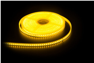
Caption 2: D-Leuchten has created 20-metre long low-voltage strips (24V DC) that can be cut every five centimetres. On the picture: „D-Flexi 20“ in warm white.