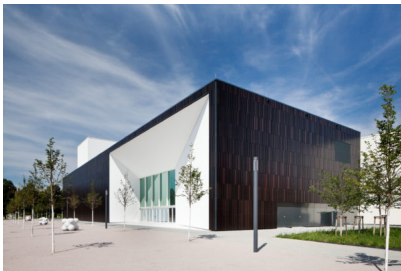
Caption 1: The multimedia complex of the Karlsruhe University of Music was built in the immediate vicinity of the tradition-rich Gottesau renaissance castle in 2013. The building, designed by Rüdenauer-Architektur, Stuttgart, houses the institutes for music informatics, music journalism and music theatre.

One of the guiding principles of the Karlsruhe University of Music is „Our commitment today decides how our culture will be tomorrow“. It places focus on the high and long-lasting quality of the young upcoming artists. With the state-of-the-art multimedia complex building serving educational needs, the state of Baden-Württemberg not only built on a solid, developing foundation, but also invested sustainably in the cultural future of the country, and with knowledge of the importance of details that achieve peak performances on a small scale.