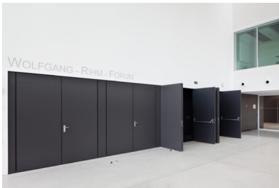
Caption 2: The fact that the door leaf and wall merge flush together is thanks to the BaSys "Pivota DX 180 3D" concealed hinge.