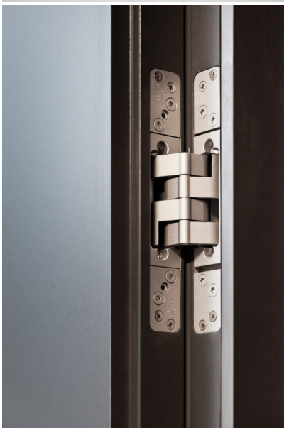
Caption 4: The heart of the BaSys "Pivota DX 180 3D" door hinge: four pistons support the joint and distribute the forces arising in every direction. The principle ensures the highest levels of stability, even under extreme loads.