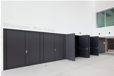
Caption 2: The fact that the door leaf and wall merge flush together is thanks to the BaSys "Pivota DX 180 3D" concealed hinge.