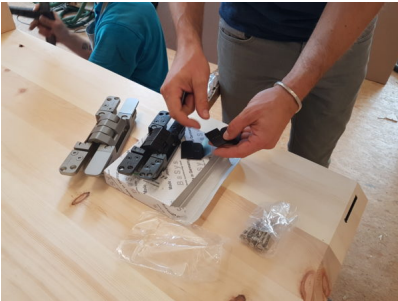
Caption 10: Concealed hinges of the "Pivota DX" product range, with load-bearing capacities of 40 to 350 kilograms per pair, cover the entire door spectrum from the simple domestic door right through to the highly complex commercial property door.