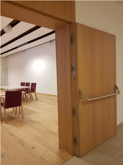
Caption 4: The special doors for the conference rooms were developed with special soundproofing requirements.