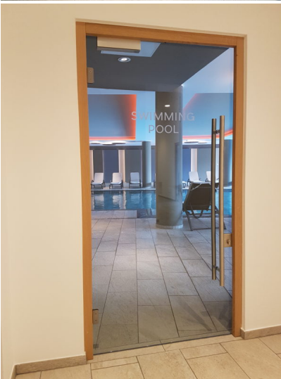
Caption 7a: The master carpentry company attests to the flexibility of its supplier, BaSys. This is demonstrated by, among others, the 30 hinges on the full-glass doors in the swimming pool and wellness facilities of the "Cristal" hotel.