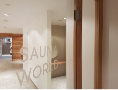
Caption 7b: The master carpentry company attests to the flexibility of its supplier, BaSys. This is demonstrated by, among others, the 30 hinges on the full-glass doors in the swimming pool and wellness facilities of the "Cristal" hotel.