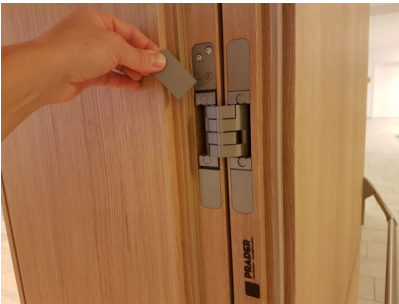
Caption 5: All of the concealed hinges installed in the "Cristal" hotel are from the designer range; here, the magnetically-held cover plate ensures a screw-free appearance.