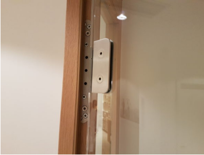
Caption 8: BaSys developed a special stainless-steel hinge with a high-quality finish that does not rust for the glass doors in the swimming pool and sauna facilities in the "Cristal" hotel.