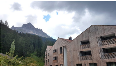
Caption 1: 96 rooms, the restaurant, conference rooms and wellness facilities including six saunas – despite its size, the "Cristal" blends harmoniously into the landscape at the foot of the Latemar massif.