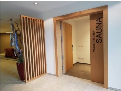
Caption 6: The experts mounted 15 of the "Pivota DX 200" hinges for 200-kilogram doors on the doors to the conference rooms and the panorama sauna.