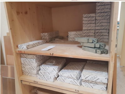
Caption 11: The master carpentry company, Prader, has been working with BaSys since 2007. Now, the entire BaSys range is always close at hand in their stores.