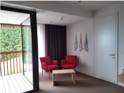
Caption 2: The door leaves of the dividing doors in the hotel rooms close flush with the door frame. The technology remains concealed and the door, with its minimalist-purist design, becomes a part of the wall.