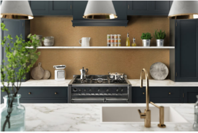
Caption 3: Horizontal lines in the midway section: Homapal decor "451 Aluminium Brushed Bronzestone" underscores this kitchen's industrial style.