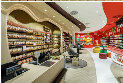
Caption 3: The new Storck Welt store in the Centro shopping centre in Oberhausen is a good reference point for the latest Homapal developments. "Werther's Original" toffees are displayed with the decor "471-636 - Alu-Polished Lava Goldtone " amongst others. Realisation: dan pearlman Markenarchitektur GmbH.