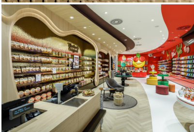
Caption 3: The new Storck Welt store in the Centro shopping centre in Oberhausen is a good reference point for the latest Homapal developments. "Werther's Original" toffees are displayed with the decor "471-636 - Alu-Polished Lava Goldtone " amongst others. Realisation: dan pearlman Markenarchitektur GmbH.