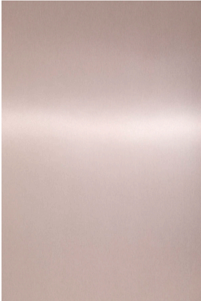
Caption 1: Designers have refined the colour progressions within the Homapal metal collection. Soft intermediate tones, such as "454 - Alu-Brushed Rosegold" complete the overall picture.

performance during Interzum. During the trade fair, the chalk artist Marco Kocks will demonstrate how personal affairs of the heart – desire, dreams, intentions, ideas, perceptions, projects – can be „de-pict-ed“, thus raising consciousness and having a positive influence on well-being – exactly the same objectives as furniture and interior design. The path to „Kreideglück“ (chalk happiness) leads through the same stations to uniqueness as Homapal: via listening to and understanding the customer desires, via robust handwork and high-quality materials.