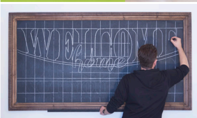
Caption 6: Marco Kocks will set the spotlight on the possibility of drawing on Homapal magnetic boards with chalk during his performance at Interzum.