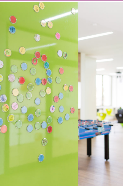
Caption 5: Attach, write and more – the Homapal magnetic boards with their diverse functions are predestined for use in schools, as in the CVG Gymnasium in Kulmbach, Germany. The decor "8232 Applegreen Glossy" sets fresh accents here (realised by Juli architektur I design, Kulmbach).