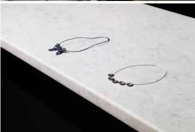
Caption 5: The postforming anti-fingerprint surface "Formica Infiniti" is suitable for both horizontal and vertical applications in heavily frequented areas. The photograph shows off one of the new collection's three patterned innovations, "F6314 Neo Cloud".