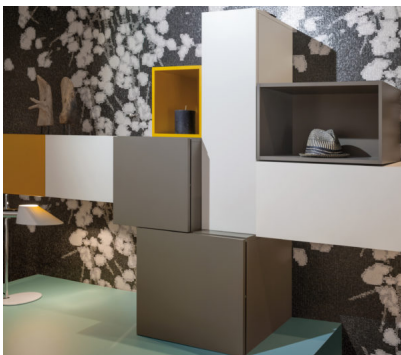
Caption 1: "Formica Infiniti" blends harmoniously into every surrounding and plays in harmony with other materials. The decors "CC7940 Spectrum Yellow", "CC2255 Polar White" and "CC5342 Earth" add elegant statements to this modular shelf system. The velvet soft surface calls out to be touched.

The environment in which customers shop today influences purchasing decisions at a subconscious level to a great extent. Surfaces that lend an elegantly stylish and timeless touch to the shop-fitting and keep their charisma over a long time period help to create special surroundings in which people love to linger.