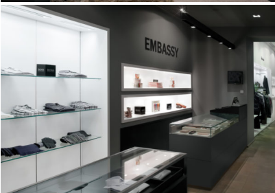
Caption 4: Predestined for shop-fitting: the anti-fingerprint surface "Infiniti" on the displays in "F2253 Diamond Black", on the walls in "F7912 Storm".