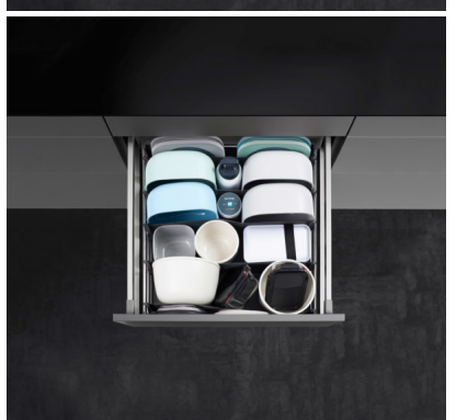
Caption 1b: ... it is the new solution to stowing storage containers of different shapes and sizes in pull-outs – saving space and providing clarity. Photo: Kesseböhmer

Caption 1a: SpaceFlexx has brought the chaos of storage containers in pull-outs to an end: ... Photo: Kesseböhmer