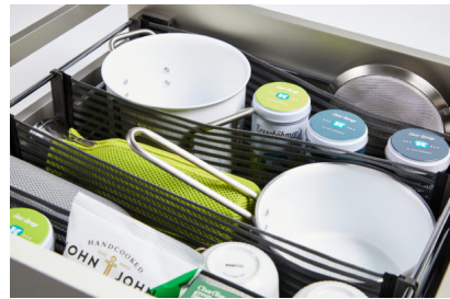
Caption 4a: Initially, Kesseböhmer aimed SpaceFlexx at the kitchen.