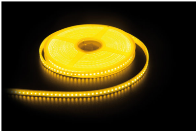
Caption 1: D-Leuchten has created 20-metre long low-voltage strips (24V DC) that can be cut every five centimetres. On the picture: „D-Flexi 20“ in warm white.

Additional benefit: the strips work on extra-low voltage; this enhances their versatility and, compared with the hitherto conventional high-voltage strips, reduces potential hazards in the event of direct contact. Consumers benefit from a high degree of colour authenticity. Using LEDs, D-Leuchten achieves a colour rendering index (CRI) of 90 and higher. With 120 LEDs per metre, the strips also provide a high level of luminous efficiency.