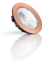
Caption 2: Its flush-fitting lens and homogeneous light give the "D-Puc Star" an understated and purist look.