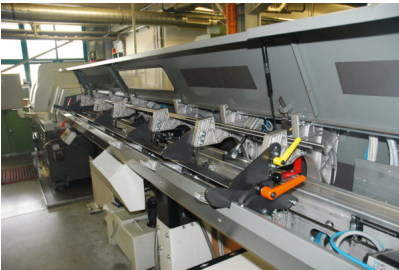
Caption 7: Schwinn plant in Krakow/Poland: Sliding head lathe for bar handles.