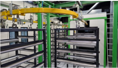
Caption 4a and b: Schwinn plant in Krakow/Poland: Wet painting.