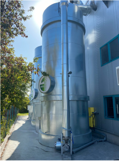
Caption 6: Schwinn plant in Krakow/Poland: Bioreactor.