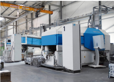
Caption 2: Schwinn plant in Krakow/Poland: Zinc die-casting machines.