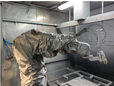
Caption 5a and b: Schwinn plant in Krakow/Poland: Powder coating.