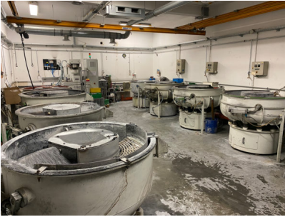
Caption 3: Schwinn plant in Krakow/Poland: Vibratory finishing/trowalising.