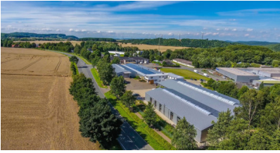
Caption 1: The building hardware manufacturer BaSys celebrates its 25th anniversary this year. The company with around 100 employees is based in Kalletal / Germany.