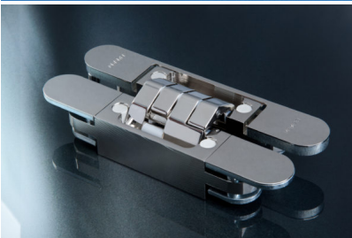
Caption 5: The "Pivota DX 61 3-D" with polished nickel-plated surface: current example of a concealed, three-dimensionally adjustable hinge for flush doors. In the "Design+" version, magnetically held panels cover the screw areas and the milled recess in the door frame.