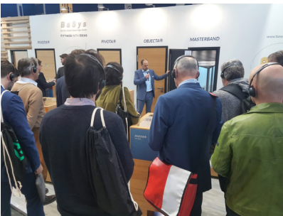
Caption 3: The BAU and Fensterbau Frontale trade fairs set the pace at which BaSys presents its innovations.