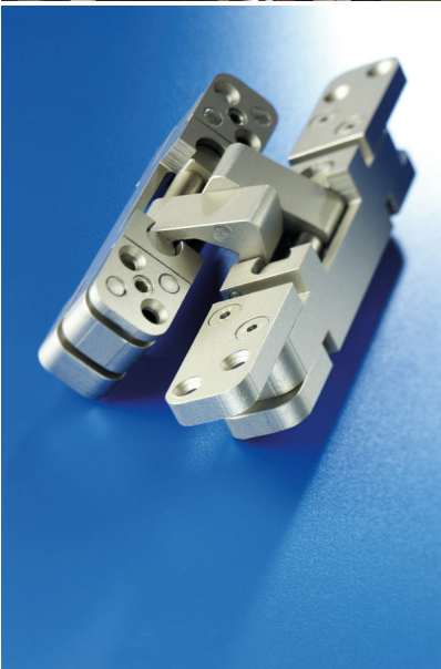
Caption 4: In 2001, BaSys was the first German manufacturer to present a concealed and three-dimensionally adjustable hinge for flush doors, thus initiating a new interior design trend. In the picture: The hinge from 2001.