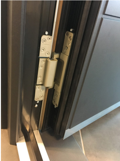
Caption 1: Centrepiece of the Basys exhibition stand at the Fensterbau Frontale 2018 is the so-called "Winnerdoor", a wood and aluminium front door from the Italian Pradamano-based manufacturer Mixall. Fitted with "Masterband FX2 120 3-D FD", Basys is using this customer door to demonstrate how the technology can be adapted for concealed hinges on rebated house and apartment front doors with 18 mm rebate and door-leaf sealing.