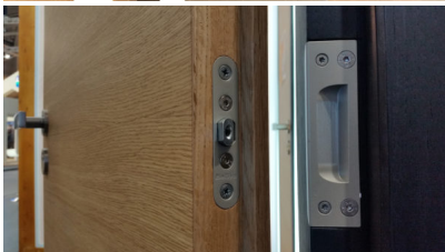
Caption 2: With the separate hinge safety mechanism, entrance doors can be secured to resistance class RC3 regardless of the type of hinge. The Basys solution is mounted on the wing side with a corresponding counterpart in the frame and remains adjustable for secure connection.