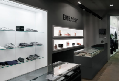
Caption 4: Predestined for shop-fitting: the anti-fingerprint surface "Infiniti" on the displays in "F2253 diamond black", on the walls in "F7912 storm".