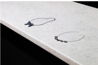
Caption 5: The malleable anti-fingerprint surface "Formica Infiniti" is suitable for both horizontal and vertical applications in heavily frequented areas. The photograph shows off one of the new collection's three patterned innovations, "F6314 Neo Cloud".