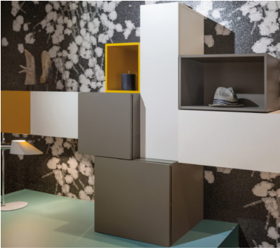
Caption 1: "Formica Infiniti" blends harmoniously into every surrounding and plays in harmony with other materials. The decors "CC7940 Spectrum Yellow", "CC2255 Polar White" and "CC5342 Earth" add elegant statements to this modular shelf system. The velvet soft surface calls out to be touched.