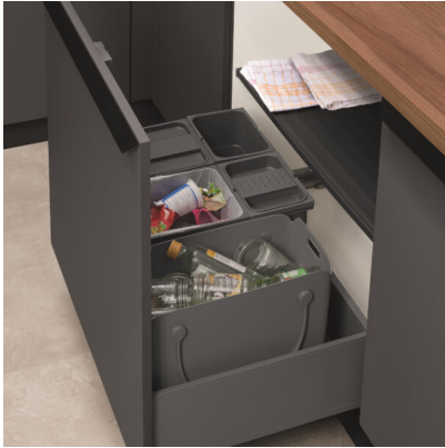
Caption 2: "taska" fits neatly next to the other waste bins and, with its retractable handles, matches the waste bins in the one2four system.