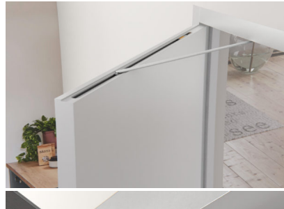
Caption 1: The running track and counterpart of the new opening angle limiter from BaSys fit flush into the narrow face of the slightly milled door rebate and frame.

The opening angle limiter is particularly suitable for doors that open reversely and therefore often stop at 90 degrees. At BAU, BaSys will be showing the new product in conjunction with the new concealed hinge "Pivota DX 110" for double-sided claddings up to 10 mm. For the company, this opens up a new product field in the area of useful hardware accessories for doors.