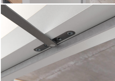
Caption 2: In contrast to other similar products, the new opening angle limiter from BaSys does not restrict the height adjustment of the door; the counter bearing in the frame is also height-adjustable and moves with the adjustment.