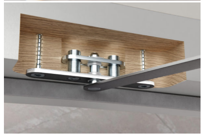
Caption 3: In contrast to other similar products, the new opening angle limiter does not restrict the height adjustment of the door; the counter bearing in the frame is also height-adjustable and moves with the adjustment.