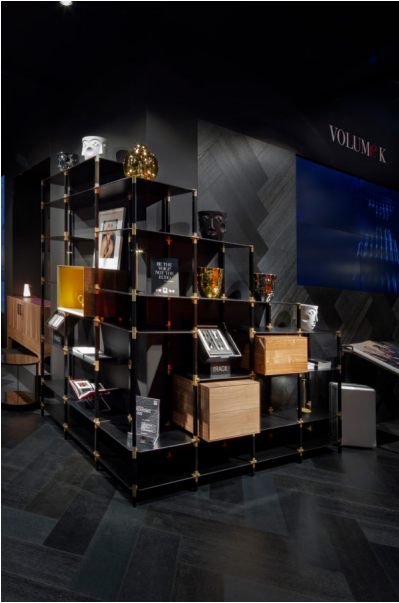
Photo: Volume K by Kesseböhmer