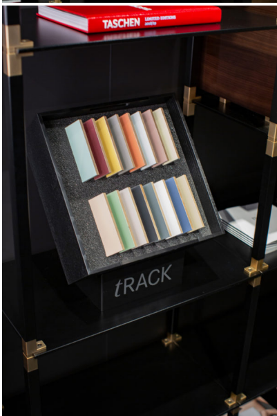
Photo: Volume K by Kesseböhmer