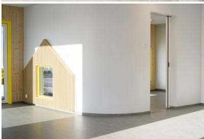
Caption 3: “Hawa Junior Acoustics” and “Hawa Porta Acoustics” in use: The example of an Icelandic play school shows that sound attenuation and room acoustics play a major part in the planning of daycare centers. These do not only help children to achieve a balanced relationship between activity and rest, but also help adults to achieve better work quality.