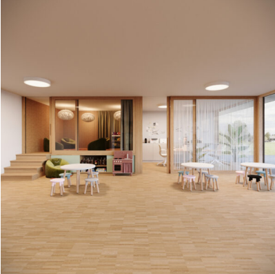
Caption 6: Sliding solutions with sound attenuation combine smooth sliding and efficient use of space with tight closing. In small apartments, for example, they provide the soundproofing between a bathroom with a washing machine and the living area, or shield the play area in the kindergarten from the office.