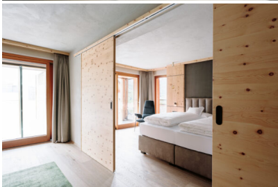
Caption 4: Large special glass sliding doors separate the sleeping area from the bathroom in this hotel suite. A “Hawa Junior Acoustics” provides the required screening and easy operation without the need for force.