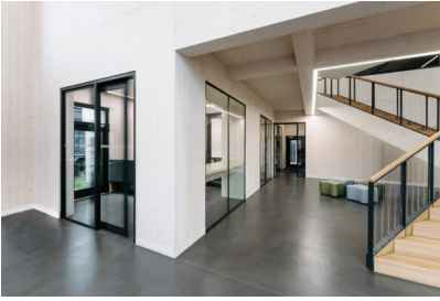
Caption 5: Sliding doors with sound attenuation to the offices make it possible to the employees to screen themselves off from the noise in the atrium and protect themselves from the drafts which blow in via the sliding doors in reception in the winter.